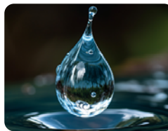
Minimising Use of Water