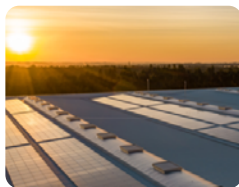
Solar Powered Warehouse Panels