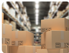
Reusing Shipping Containers