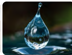
Minimising Use of Water