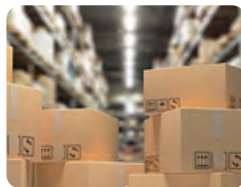
Reusing Shipping Containers