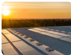
Solar Powered Warehouse Panels